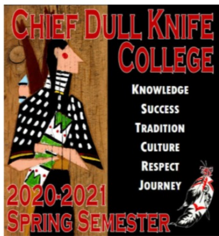
CREDIT CHIEF DULL KNIFE COLLEGE POSTER WITH A TRIBAL MEMBER ILLUSTRATION AND THE WORDS "KNOWLEDGE, SUCCESS, TRADITION, CULTURE, RESPECT, JOURNEY"

"The area that was most alarming, of course, is the pretty significant decrease in the number of first year students."