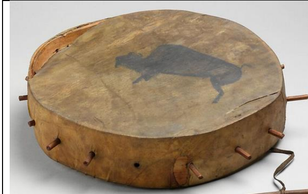
5: čáŋčeġa miméla